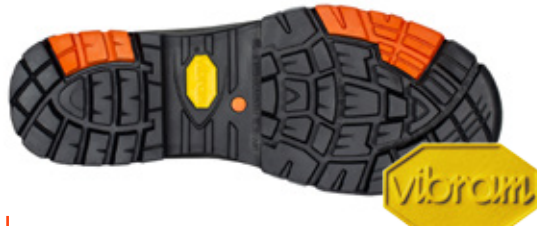
FIRE & ICE

Dual component sole: direct injection Esolight 1.0 midsole with the insertion of Vibram® Rubber Fire&Ice outsole.